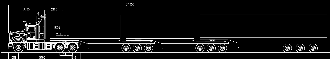
SUPER-LINER 6X4 36" HIGH-RISE SLEEPER WITH 35 METRE MODULAR B-TRIPLE